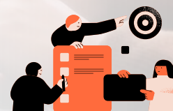
Back Office Processing