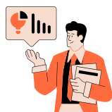
Sales and Marketing