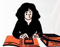
Accounting and Bookkeeping