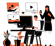
Social Media Content Management