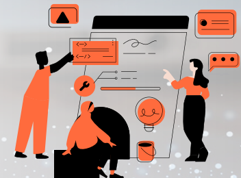
Startup MVP (Minimum Viable Product)