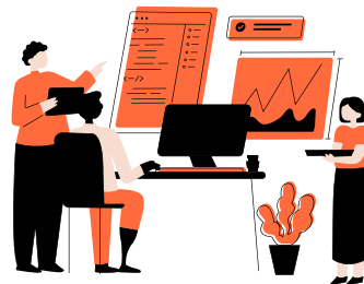
Custom Software Development