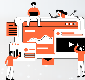
Website Design and Development