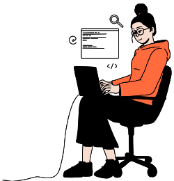
Basic Software Apps and Tools