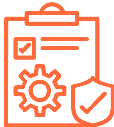
Quality, Alpha and Beta Testing